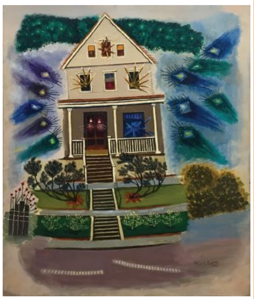
Distraught House, 1949

perspective, flattened patterning, and mix of the natural and industrial presented as a total vision.